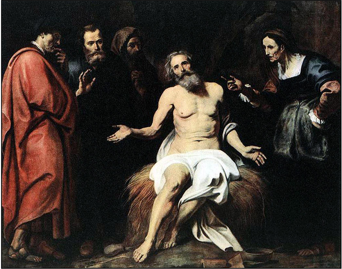
The Patience of Job by Gerard Seghers (1591-1651)